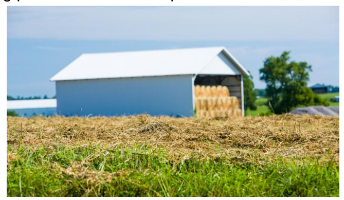
Field of cut hay.

The day will close with four top KY hay producers discussing Orchardgrass, Timothy, Teff, and Fescue/mixed hay production. These will be very practical discussions with explaining successful methods for establishment, fertilizing, harvesting and marketing. The floor will then be open to questions.