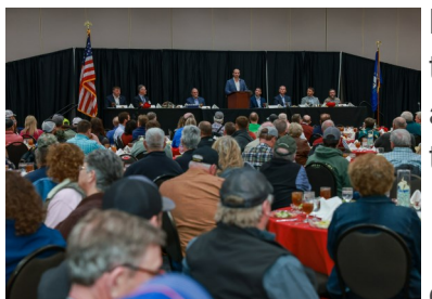
Luncheon at KY Commodity Conference

Thursday, January 16, 2025 marks the date for the 31st Kentucky Commodity Conference, to be held at the Sloan Convention Center in Bowling Green. This annual meeting of